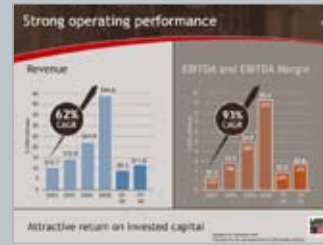
LAB International Presentation