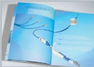
CryoCath Annual Report