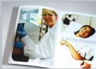
Helix Annual Report