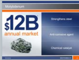
Mercator Minerals Presentation