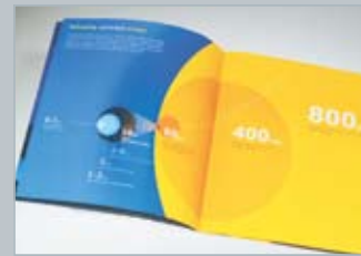
AXIA Annual Report